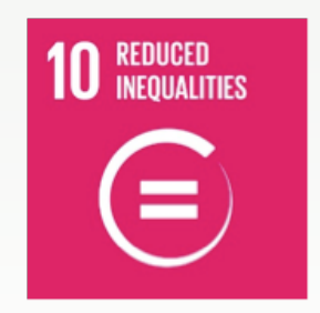
Reduce inequality within and among countries.