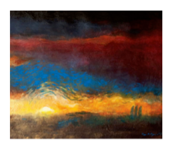
Renewing The Promise A Pastoral Letter for Catholic Education