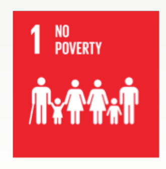
End poverty in all its forms everywhere.

The United Nations Sustainable Development Goals that connect to the pastoral theme are: