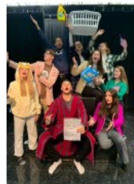
Some members of the senior drama class pose after a very dramatic 'ritual' performance