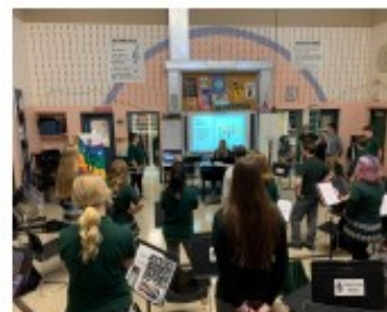
Grade 12 vocal students lead the class in warm-ups

Vocal & Dance Showcase: January 18th, 2023