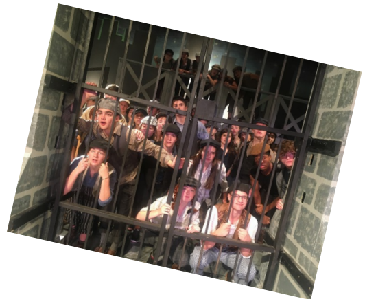
October Rehearsals for Newsies