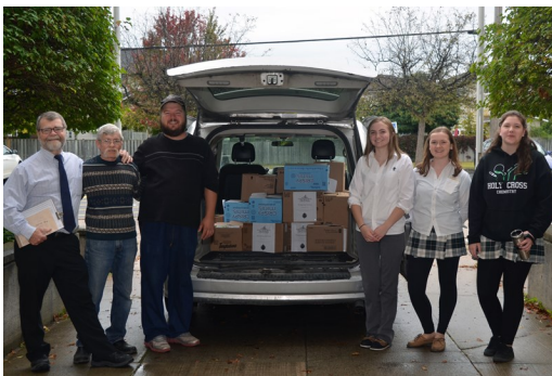
Thanksgiving Food Drive

November 5th, 30 students from the DECA Business Team are traveling to Whitby, Ontario