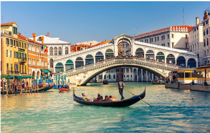
Italy Switzerland 2018

Any vendors wishing to participate in the Jamaica Mission Trip “Handmade Only” Crafters’ Show at Holy Cross must do so soon. The show runs from 10-3 on Saturday Oct. 14, 2017. A 6’ table is only $30.00 and admission is free. Vendors get to keep all their table profits. To secure your spot or for further information please contact: jandewy@yahoo.com . A friendly reminder to those currently signed on that payment is now due.