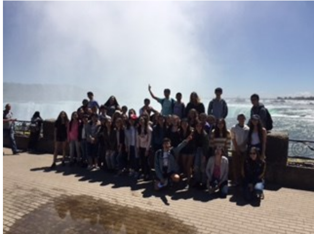
Our International Club trip to Niagara Falls 48 students from Kingston and Belleville.