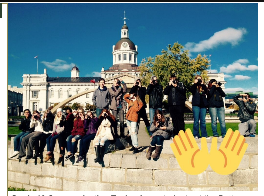
Grade 12 Communication Technology students at the Battery, Confederation Basin, doing architectural and landscape photography as part of their grade 12 portfolio development course, building college and university applications.

Dec 21– Arts Department Coffee House @ 7:00 pm in the cafeteria Dec 23—Final instructional day before Christmas holidays