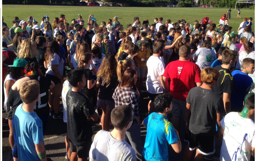
Grade 9 Students enjoyed a day of group activities, getting to know each other, and getting green & dirty.