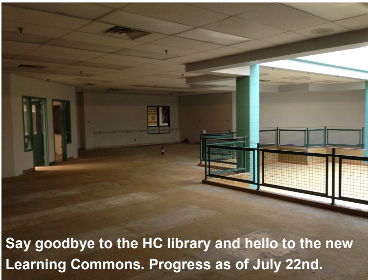
Say goodbye to the HC library and hello to the new Learning Commons. Progress as of July 22nd.