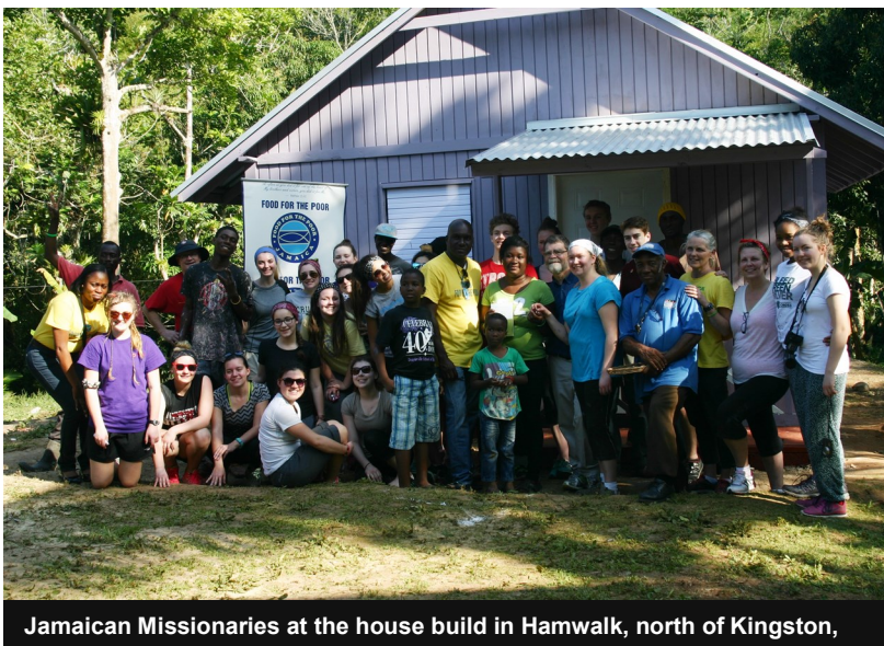
Jamaican Missionaries at the house build in Hamwalk, north of Kingston,