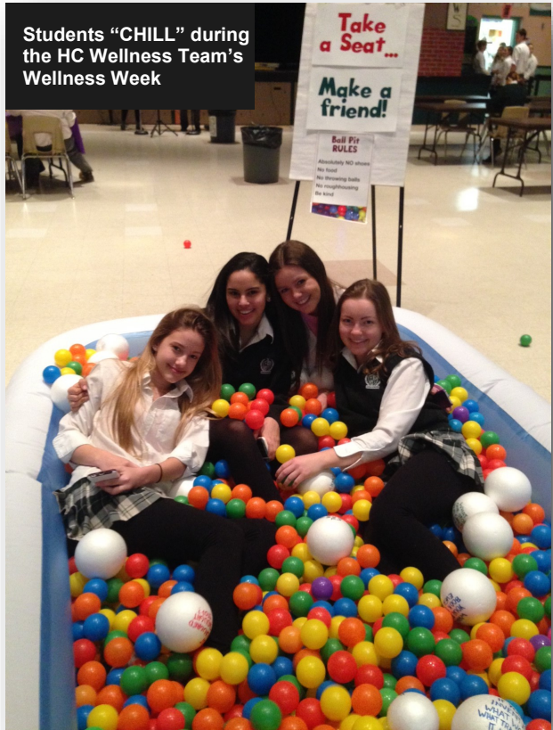
Students "CHILL" during the HC Wellness Team's Wellness Week