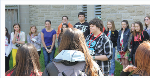
A mentoring program for Aboriginal high school students interested in academic and cultural enrichment.