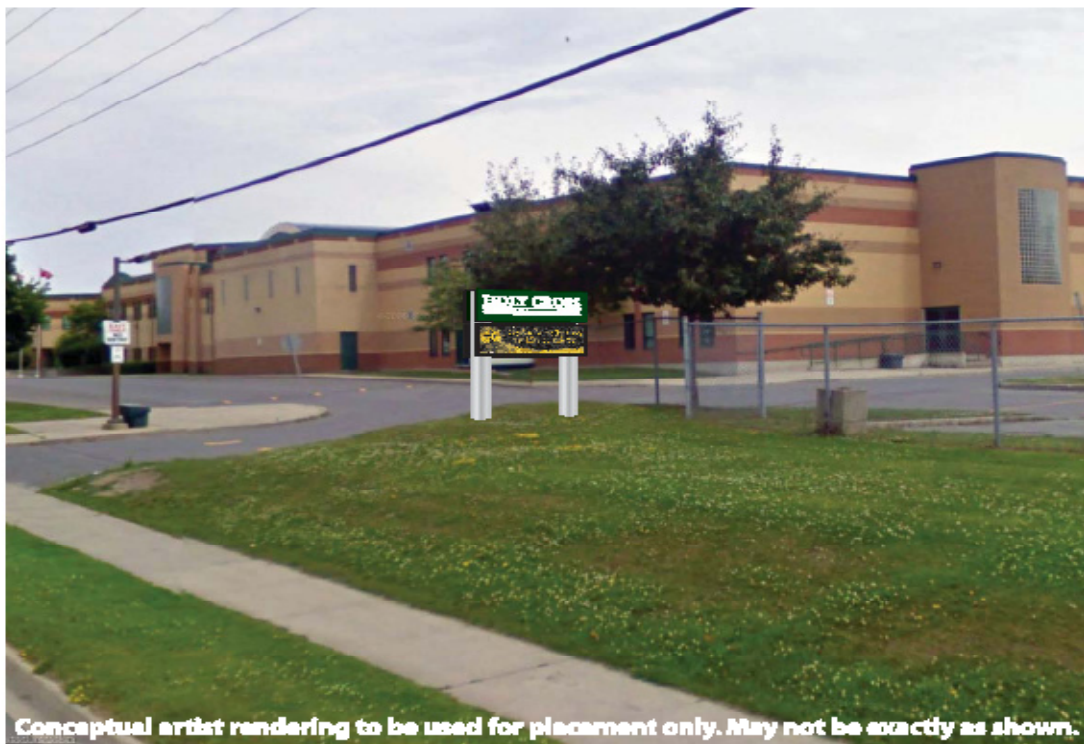
Conceptual artist rendering to be used for placement only. May not be exactly as shown.