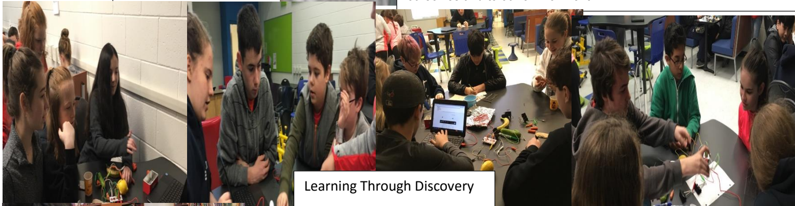
Learning Through Discovery