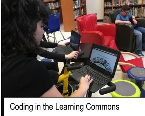
Coding in the Learning Commons