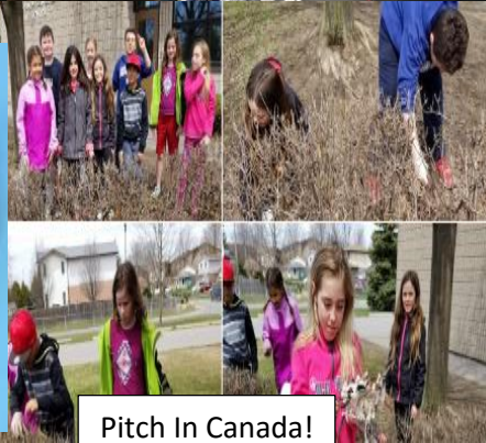
Pitch In Canada!