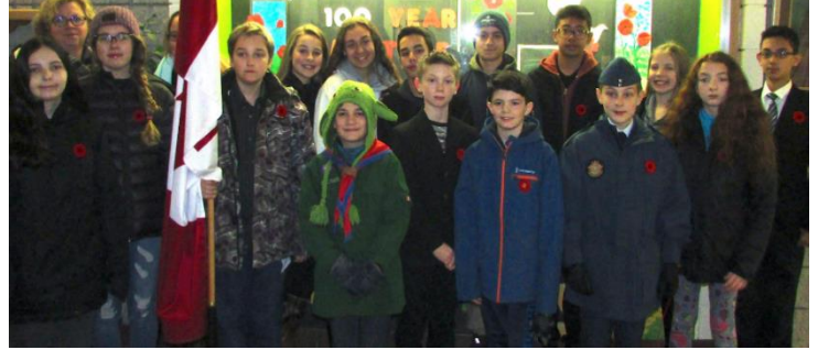
Our student representatives lay flags as part of the annual "Day of Remembrance" service held at the Cataraqi Cemetery.

Encourage your child to be a lifelong learner of French!