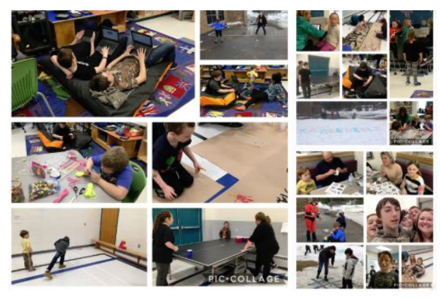
Thank you to all staff and students that helped organize and run the stations for a fun filled afternoon!