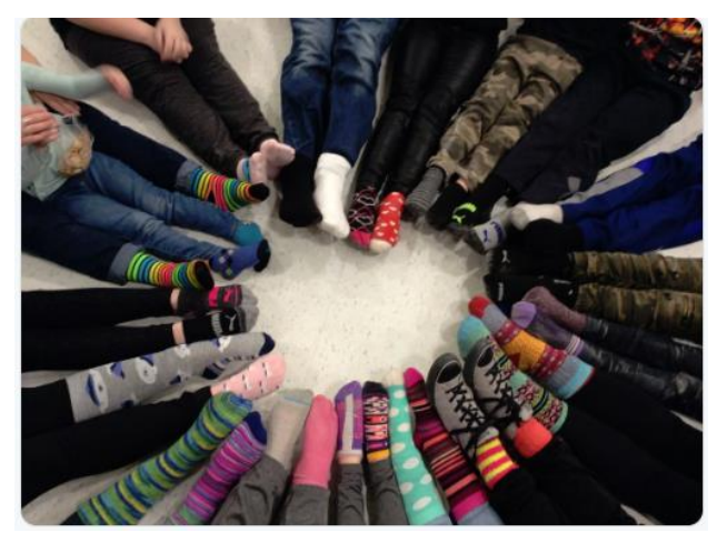
Thank you to our staff and students for wearing mismatched socks on World Down Syndrome Day!