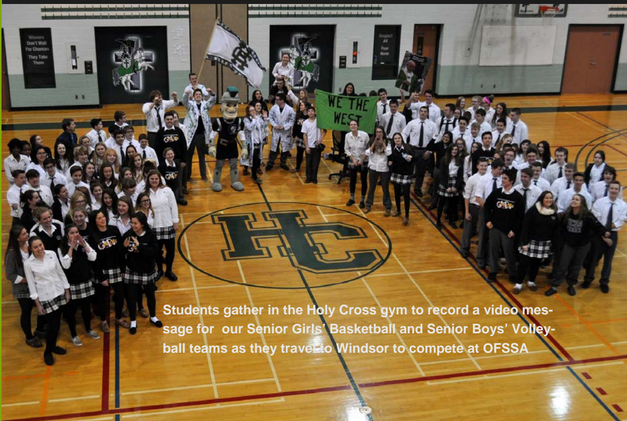
Students gather in the Holy Cross gym to record a video message for our Senior Girls' Basketball and Senior Boys' Volleyball teams as they travel to Windsor to compete at OFSSA