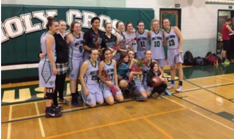
KASSAA Champion Sr. Girls' BBall on senior night at the Holy Cross gymnasium.