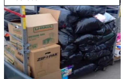
ECO School News